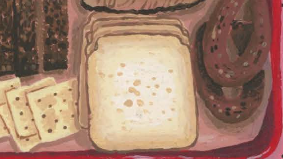
Saltines Bread Sausage