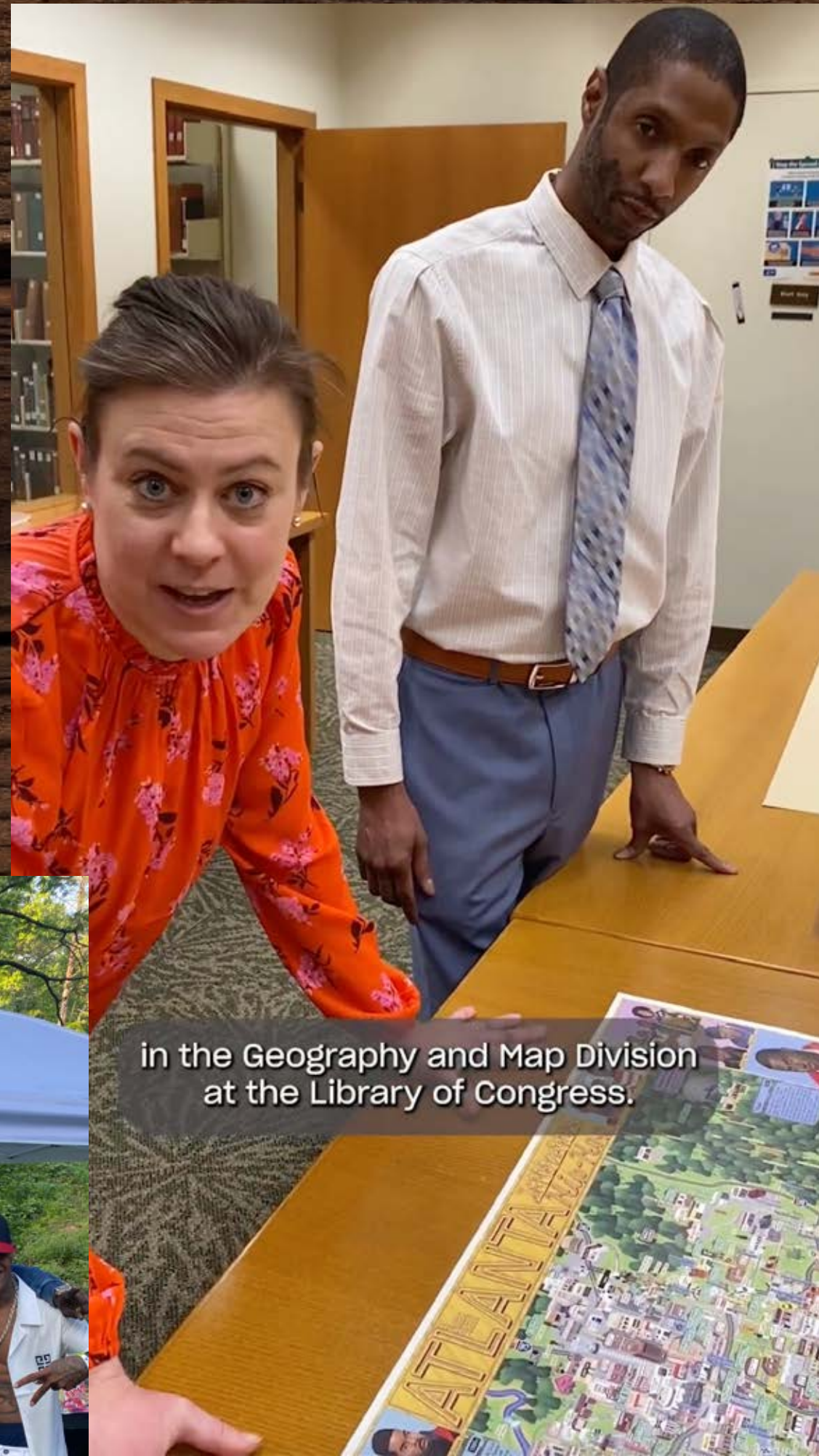
in the Geography and Map Division at the Library of Congress.