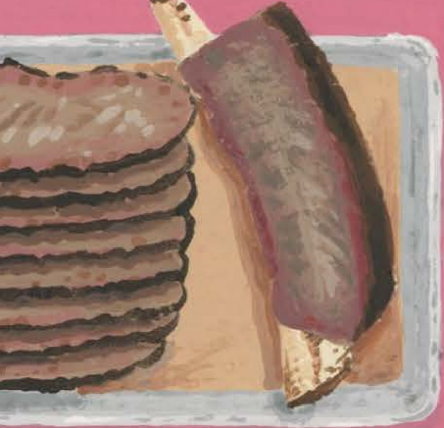
Brisket Beef Rib

Central Texas Cradle of TX BBQ & home of the TX trinity: brisket, sausage & ribs